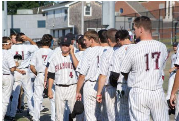
The Commodores line up by the first base line for the National Anthem.

The Commodores (21-23) began the season well above .500 with a 9-5 run back in June, yet managed to drop well below .500 midseason after an eight game losing streak. The mid-year slump didn't stop the Commodores. They fought back to a .500 record with a hot five game win streak to prove they weren't about to give up a playoff spot.